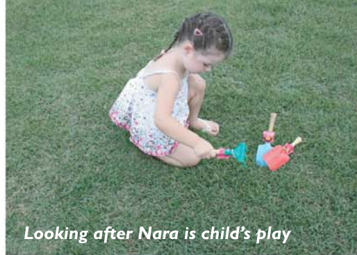
Looking after Nara is child's play

Nara after many months without mowing. This native turf is an easy to grow, non fussy turf. It is OK for fresh water areas or coastal salt laden areas.