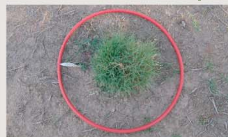
Nara grew much faster than any of the other Zoysia macrantha selections. Common Zoysia macrantha at the same age.

Nara has been grown in Windsor on different sites, and in Brisbane, Melbourne, Sunshine Coast and North Queensland. The results have been excellent, with rapid establishment on all sites. Nara has a slightly finer leaf than the only other widely grown Zoysia, namely Empire (not native). It has a different colour, typical of other Zoysia macrantha types, and when unmown it is easily identified as it has the typical Zoysia macrantha look, having more elongated leaves than the japonica forms. When mown, it forms a dense mat, but is not a thatchy turf. It has very quick spring green up, and has better Winter colour than couch lawns. Weeds can be sprayed out with most herbicides that can be used on Couch. We recommend not planting in Winter in Sydney and Melbourne as it is slow to establish in the cold. In moderate or warm weather Nara establishes well.