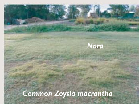
This is the final breeding selection trial. Prior to this stage came almost a decade of research and breeding.